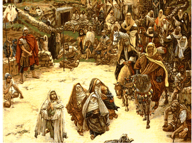
What Our Saviour saw from the Cross by J J Tissot

This statement by Jesus is actually one single word in the original Greek: TETELESTAI . It was a word that was stamped on debts when payment had been collected. According to Matthew 27:50 and Mark 15:37, it was said in a loud, strong voice. So what was Jesus trying to tell us by shouting, TETELESTAI ?