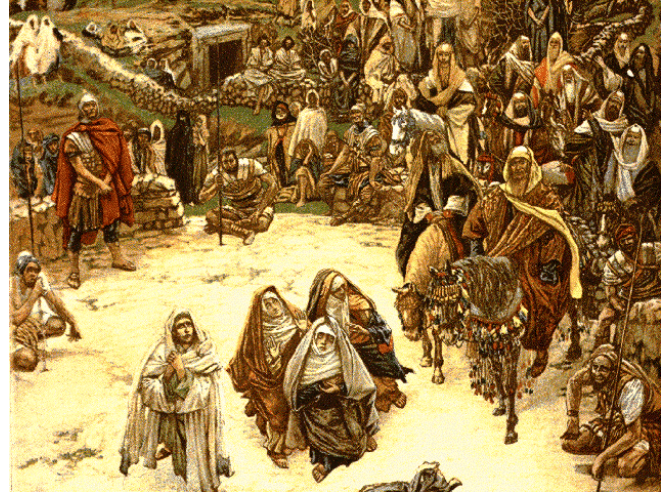
What Our Saviour saw from the Cross by J J Tissot

This statement by Jesus is actually one single word in the original Greek: TETELESTAI . It was a word that was stamped on debts when payment had been collected. According to Matthew 27:50 and Mark 15:37, it was said in a loud, strong voice. So what was Jesus trying to tell us by shouting, TETELESTAI ?